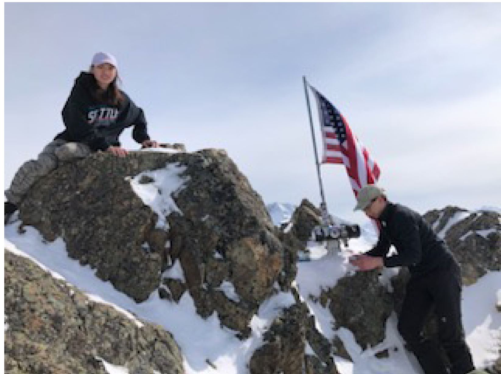
Birchwood Squadron hike Lazy Mtn Trail April 15th