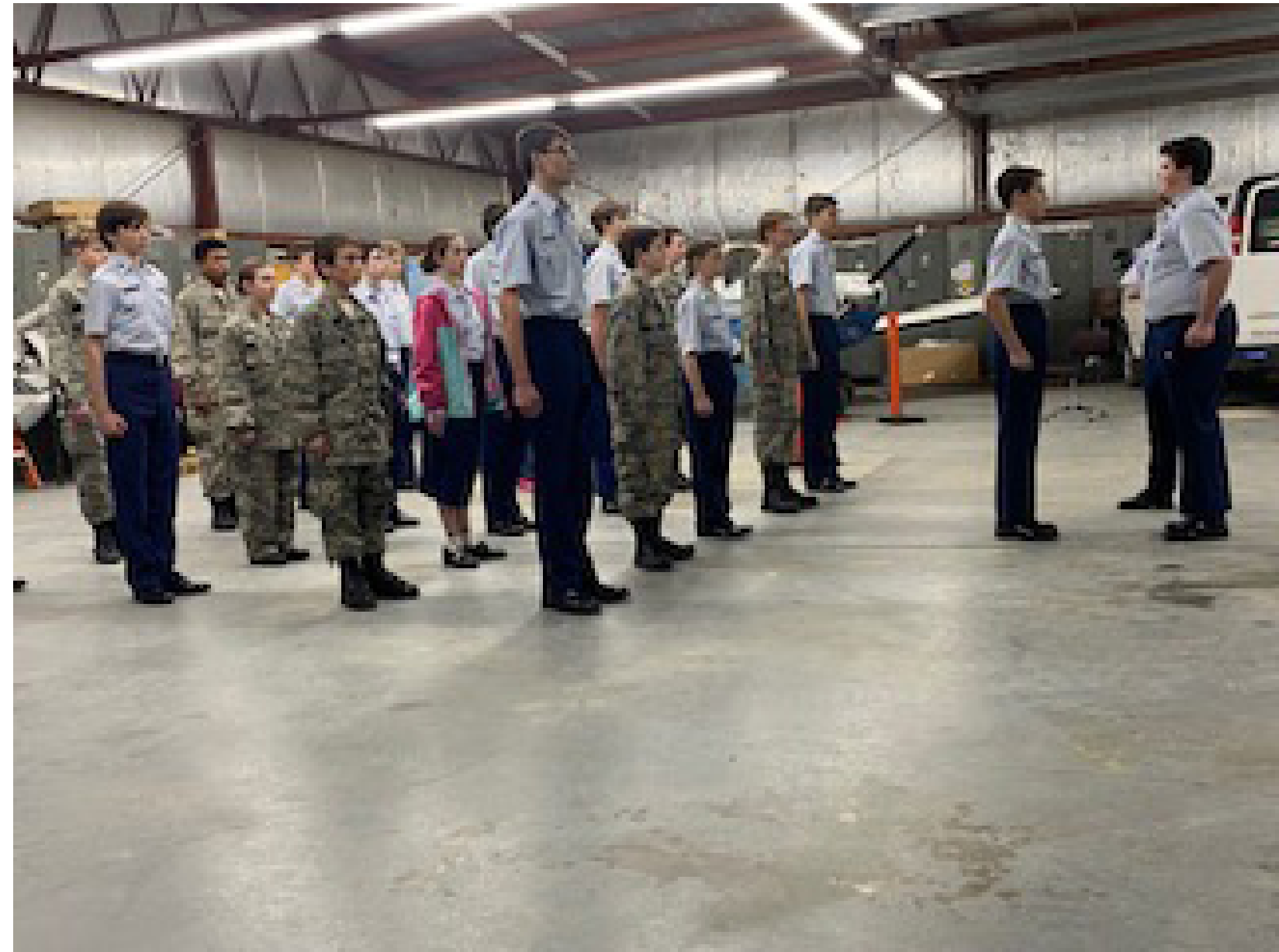
Kenai and Homer Formation

All cadets are working hard, setting a good example in our community and supporting each other in practicing the Core Values.